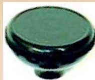
C68 and C71 (Red Only)