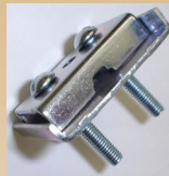
Connector Fitting C66